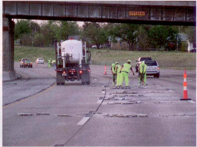
In 2004, ODOT initiated repairs for all eastbound and westbound lanes, including auxiliary and ramp lanes, on I-44. The work was broken down into five phases and was completed in 2009. The total value of this final phase of the project was approximately $2.9 million, and the repair is expected to offer another 15 years of service life.

Transportation Research Board state that for every dollar invested in appropriately timed preventive pavement maintenance, $3 to $4 in future rehabilitation costs are saved.